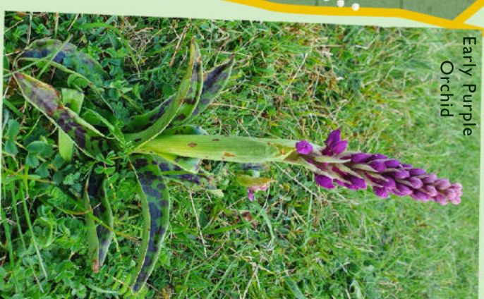
Early Purple Orchid