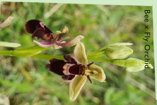
Bee x Fly Orchid

As a result of its great grassland it also has lots of invertebrates, including Small Blue, Grayling and the rare Duke of Burgundy butterflies.