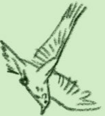
The Toots Leng Barrow