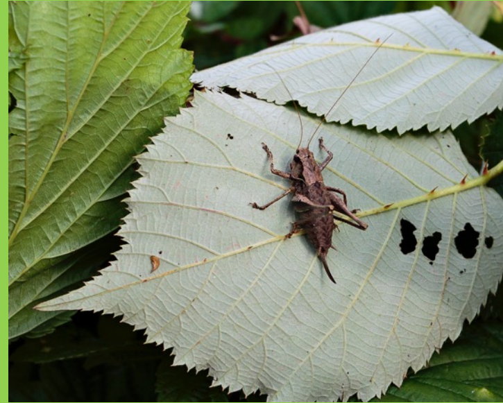
Dark Bush cricket.