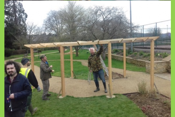
Great team work and woodworking skills from all to build a beautiful wooden pergola at the sensory garden space.