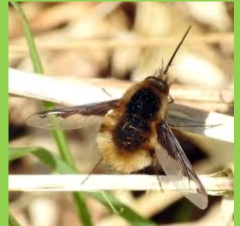
Dark-edge bee fly.

Other wildlife sightings at the wetland.