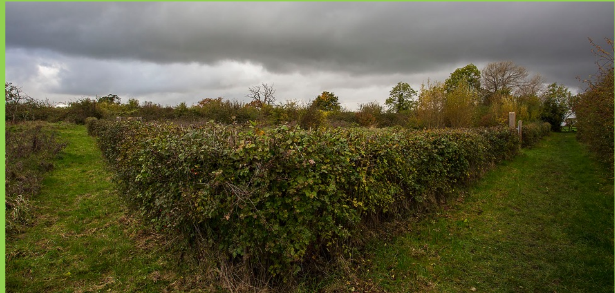
Hedgerow management through the seasons, Wild About Kingswood.