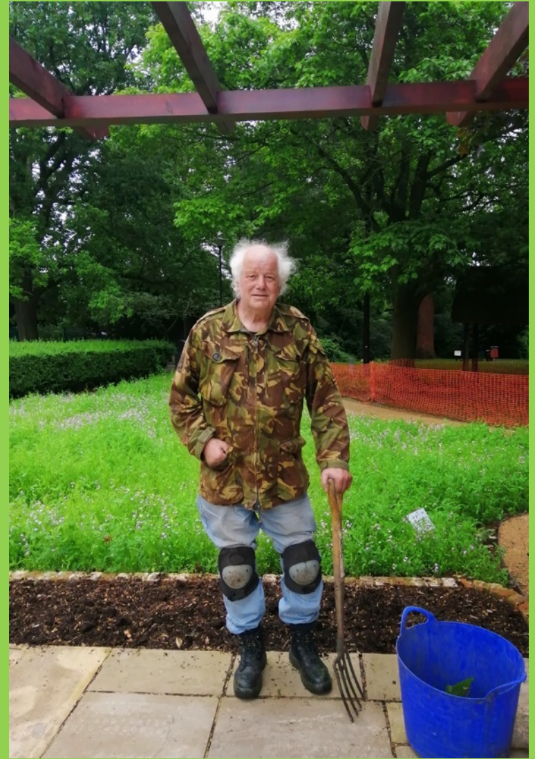
Mr Flight's wildflower meadow.